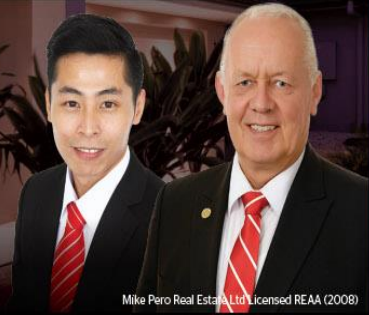
Mike Pero Real Estate Ltd Licensed REAA (2008)