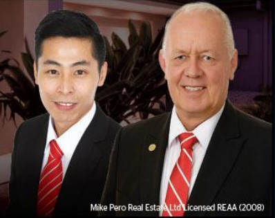
Mike Pero Real Estate Ltd Licensed REAA (2008)